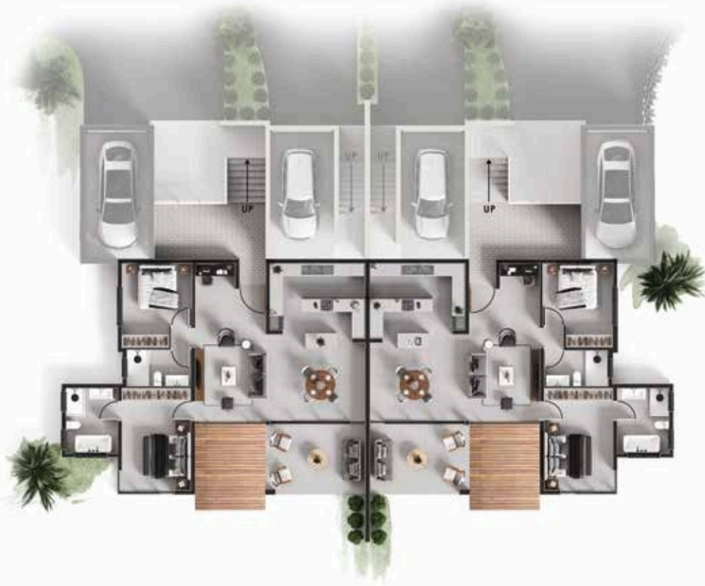
GROUND FLOOR ADJOINED SINGLE STOREY HOUSE 1 & 2

* Optional extras: Pergola / Decking / splash pool & more