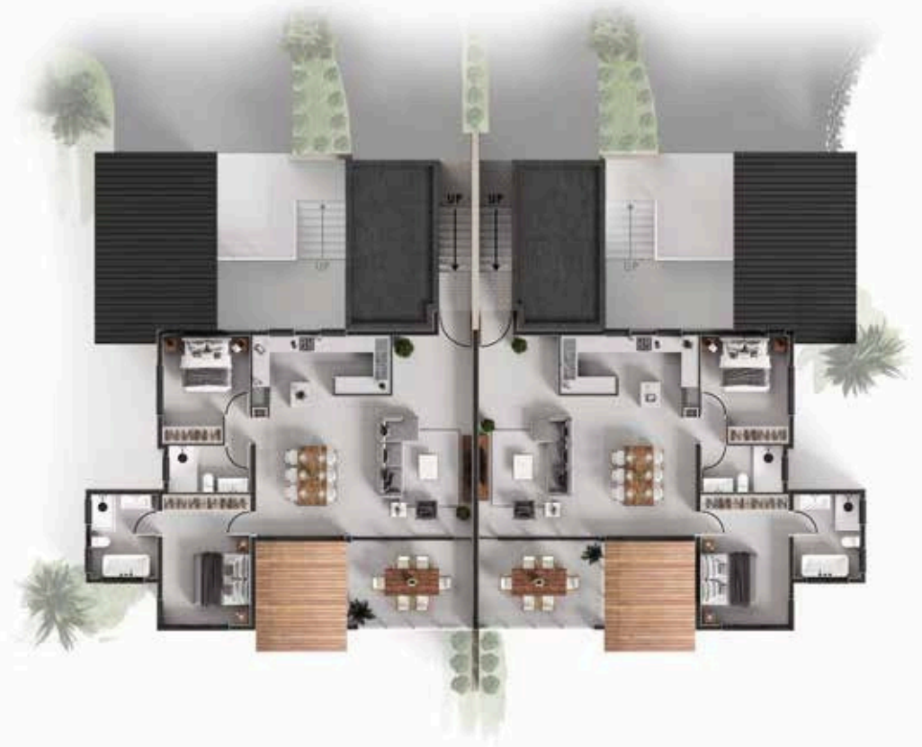
FIRST FLOOR ADJOINED SINGLE STOREY HOUSE 3 & 4