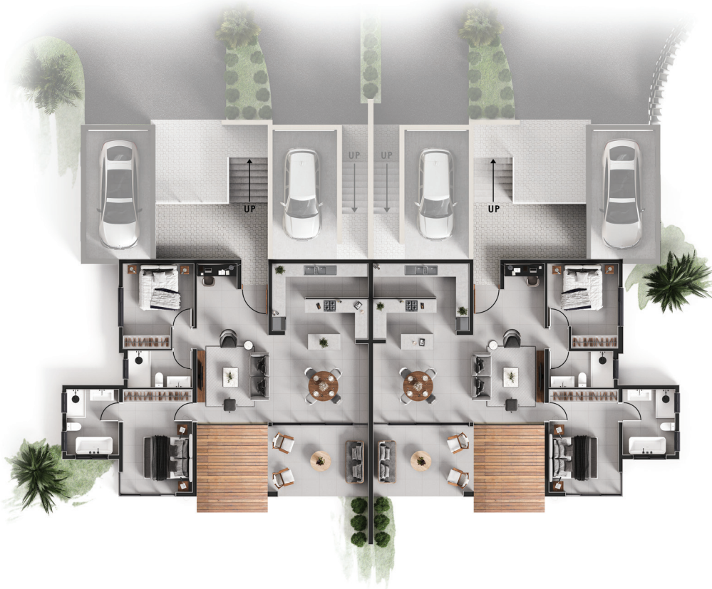
GROUND FLOOR ADJOINED SINGLE STOREY HOUSE 1 & 2

* Optional extras: Pergola / Decking / splash pool & more